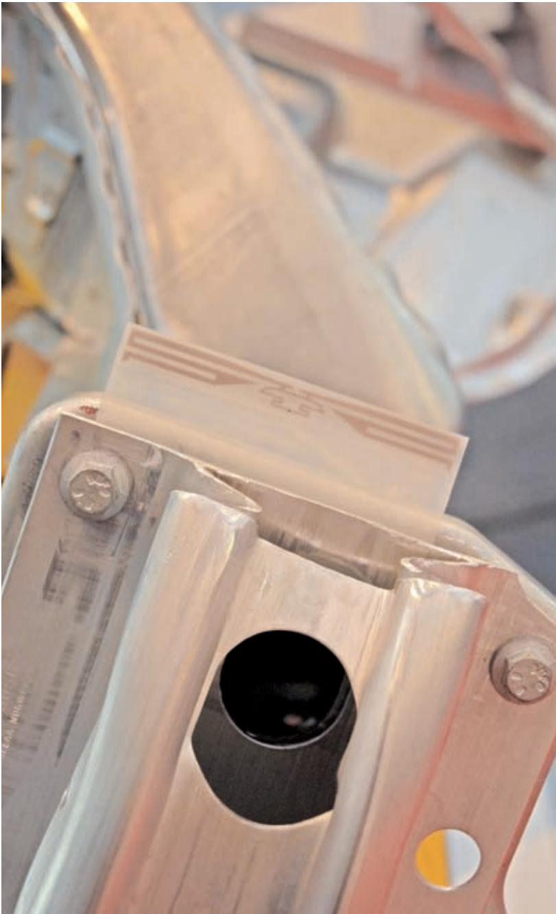
At Volvo in Gent, a robust plastic tag is attached to the side member of the vehicle body directly at the beginning of the shelling

tures up 200 °C can cause problems to the electronics of most data carriers, the tag stays on the vehicle. Most car manufacturers paint their vehicle bodies three to five times and expose them correspondingly frequent to the high temperatures. The electronics of conventional data carriers often break during this procedure. With a few technical tricks, Turck is able to deliver disposable data carriers that are able to resist a limited amount of high-temperature phases and therefore can stay on the vehicle all the time. Essentially it is only a question of the durability of the connection between the ICs and the antenna coil under the influence of high temperature. Classical solder connections are unsuitable. Instead, technologies like friction welding are used to guarantee a lasting stability. Alternatively, an inductive coupling can be used instead of the direct connection, although it needs more energy during the transmission.