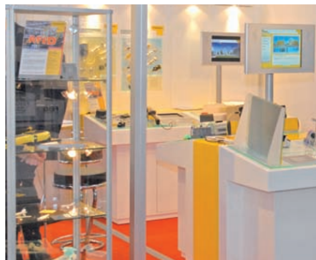
At exhibitions, Turck demonstrates the feasibility of gen

The fact that UHF-challenges can be mastered and carry considerably lower data carrier prices – a temperature resistant design costs about 50 cent today – convinced