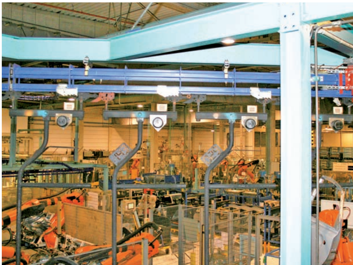
Until today, usually the transport systems are identified by RFID data carriers, like in this example the transport hangers of the supplier Tower Automotive

many automobile manufacturers to equip the coming model ranges with data carriers on the vehicle bodies, which means that they can be identified throughout the whole process, from shelling to painting. But this is not all: In further projects where Turck is involved, the possibilities are tested to also optimize the delivered parts of the suppliers with RFID and thereby optimize the whole production process up to the final assembly with the wireless identification.