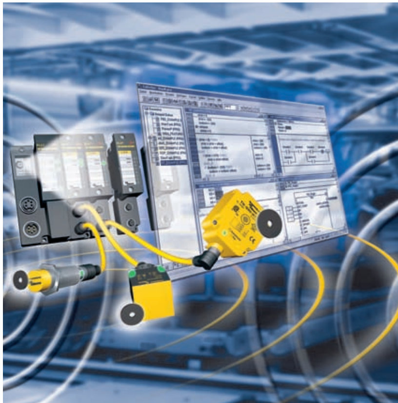
Turck's modular RFID system, BL ident, can operate interference free HF and high transmission range UHF combined read/write heads at the same time

This procedure is a typical example for the previous use of RFID-technology in the automobile production: Mostly monorail conveyors, skids or other carriers for the vehicle body and larger components, like engines or axles, are identified. Compared to optical measuring, this procedure increased the performance remarkably, but with further development of data carriers and combined read/write heads, the potential has increased even more. Nearly all automobile manufacturers think about equipping the vehicle bodies or even the single components with a tag directly instead of equipping the transport system. This has the additional advan-