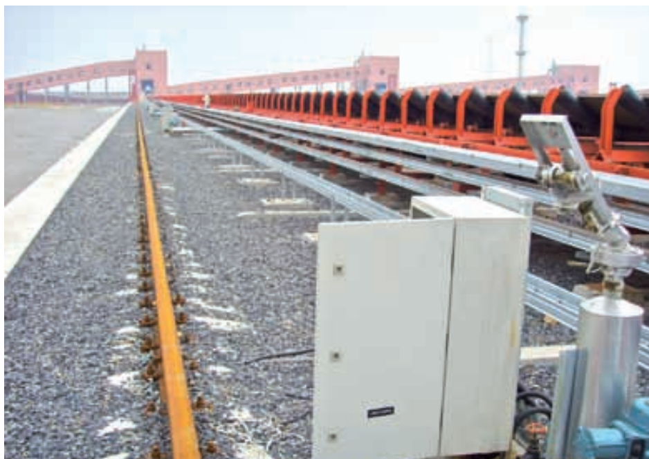
Each sprinkler is equipped with a control cabinet with a BL20 station