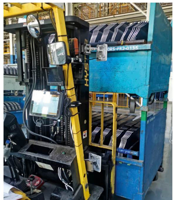
The UHF antenna on the truck identifies the container ID and updates the location in the WMS; the transport jobs are displayed directly on the monitor